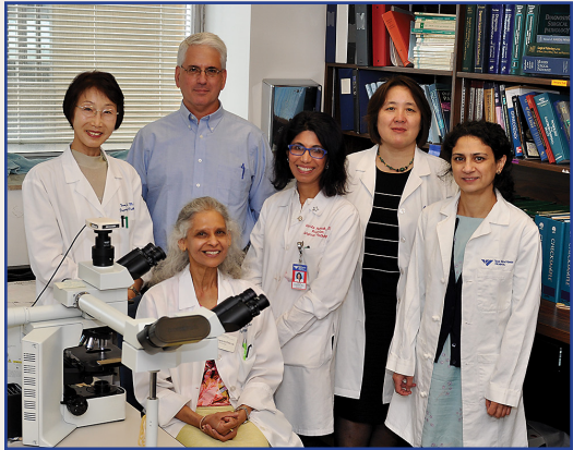
Yale Pathology at Bridgeport Hospital

Patient Financial Services: 800-826-9922 toll free